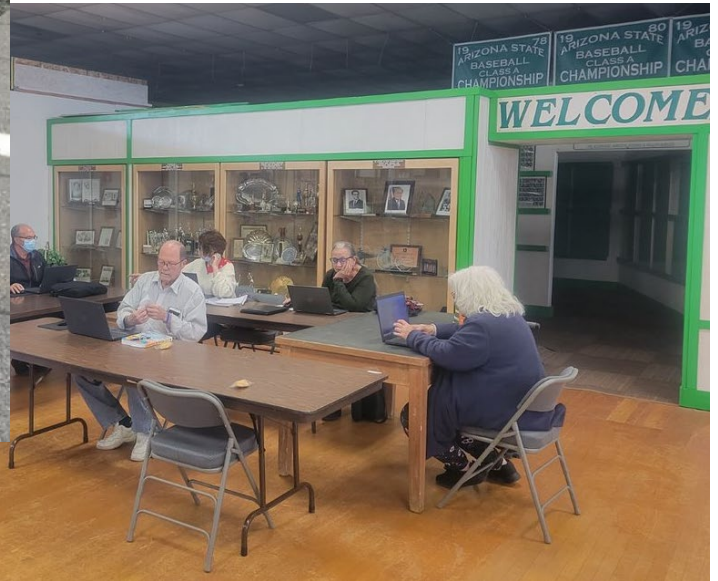
Miami Memorial Library offered classes for seniors to learn computer basics.

In this large Congressional District, 31 public and tribal libraries received 77 LSTA and ARPA grants totaling $1,032,275.00. Their community members benefited from expanded WiFi access; timely technology assistance; healthy outdoor spaces for family activities; bilingual programs; and enhanced print and electronic collections.