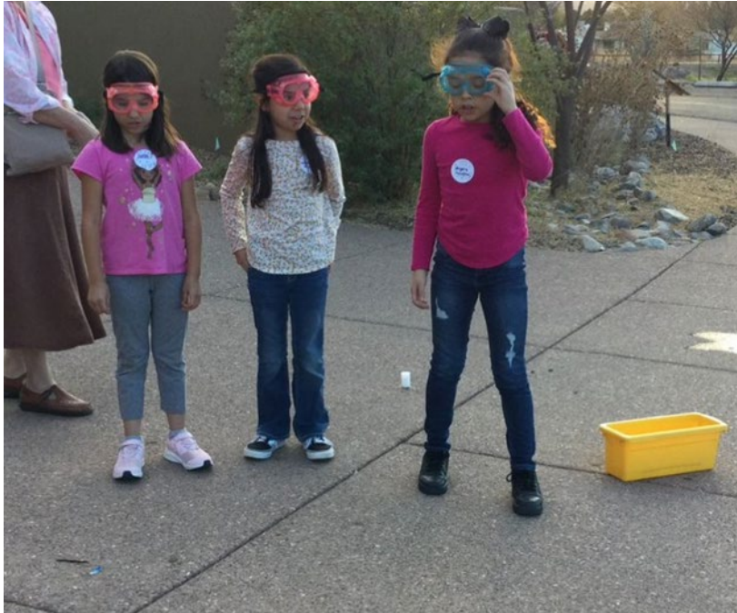
Children at the Camp Verde Community Library learn engineering by experimenting with seltzer rockets.

Libraries in CD 2 supported their community members with improved access to information and learning opportunities for people of all ages.