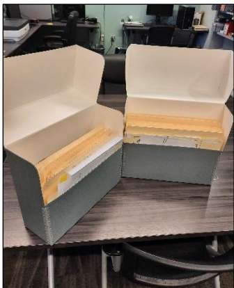
Preserving the Town of Prescott Valley's History