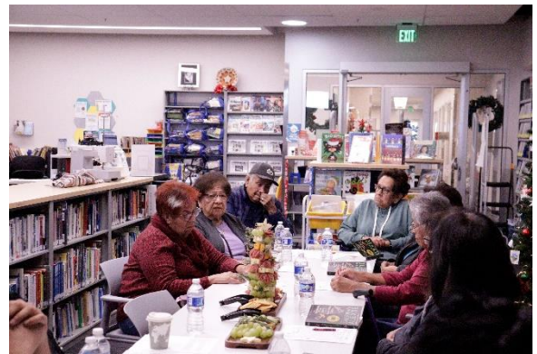
Enhanced Adult Services Salt River Tribal Library

Federal regulations require that grant recipients take reasonable steps to ensure meaningful access to the information, programs, and services they provide to people with limited English proficiency. Please consider language assistance services, if appropriate, when designing your project.