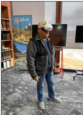
XR at Page Library