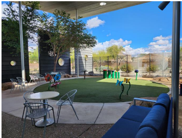
The Music Garden at Sunrise Mountain Library Peoria Public Library

https://imls-spr.imls.gov/Public/Projects