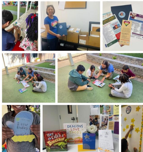
Family Literacy Connections Scottsdale Public Library