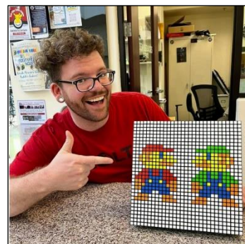
Summer Cubing Mosaics Camp Verde Community Library