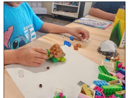
Brick by Brick Kaibab Paiute Tribal Library