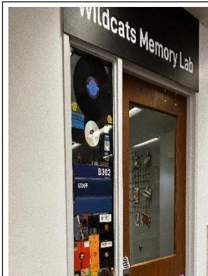
Wildcats Memory Lab University of Arizona