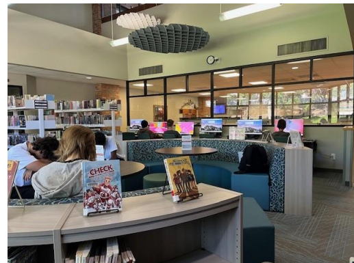
Teen Time Prescott Public Library

If awarded a grant, public and school libraries must certify that they are CIPA compliant before receiving LSTA funds to purchase computers to access the Internet or to pay for the direct cost associated with accessing the Internet. If funded, you will certify this on a form sent to you by the State Library. For more information about CIPA, go to http://www.ala.org/advocacy/advleg/federallegislation/cipa/ .