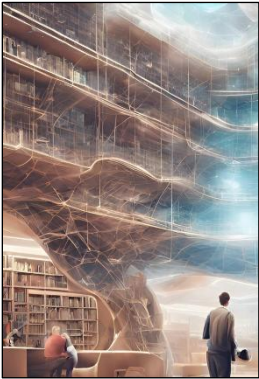
AI Generated Image