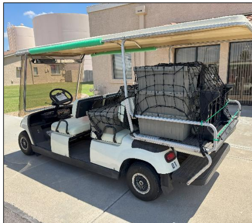
Golfcart Bookmobile Youngtown Public Library