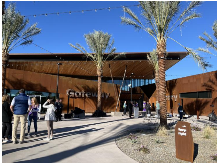
Gateway Branch Mesa Public Library