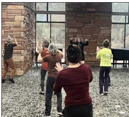
Sedona Public Library