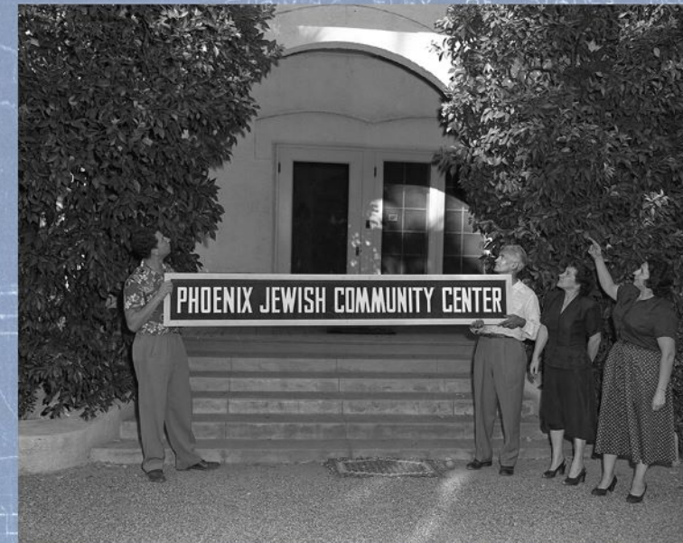
This photo is of the Jewish Community Center located on leased area on the Heard Estate. Current location of the Heard Museum. Image JCC 1954.