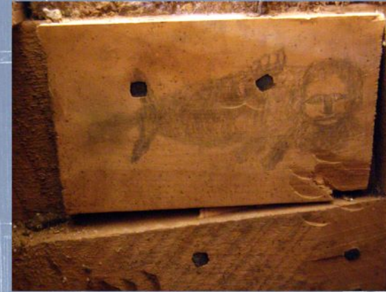
Winsor Castle at Pipe Spring National Monument is a fortified ranch house constructed 1870-1872. This drawing was located in the floorboards of one of the rooms. The "Fish Person" is on a nailer supporting floorboards, and unfortunately is not visible today due to installation of beams in the ceiling of the floor below.