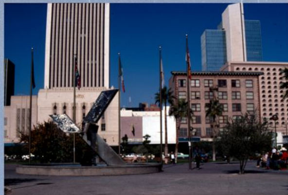
Patriot Square Park was an urban park in downtown Phoenix. It was largely destroyed in 2009 to make way for the new City Scape office and retail project. Image 03-0871.