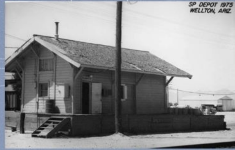
Southern Pacific Railroad Depot, Welton, AZ. Built in the 1920s and operated until 1950 when it was torn down.