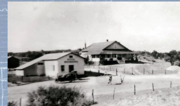
Lawson Merchandise Store and Estill House. Oracle, AZ, 1920.