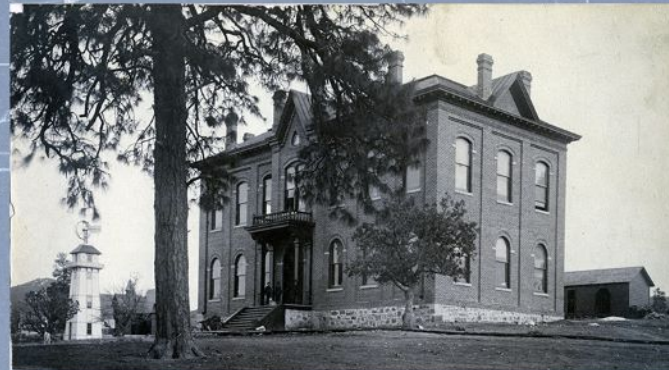
Prescott High School during the 1890s. The building was constructed in 1884 and was used as a territorial legislature meeting place until 1889, when the capitol was moved to Phoenix. However, in 1914 the building was demolished.