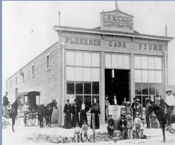
C.R. Michea Florence Cash Store 1897, Florence AZ. After being a downtown Florence landmark for 120 years, this historic building caught on fire on May 24, 2011, and was demolished.