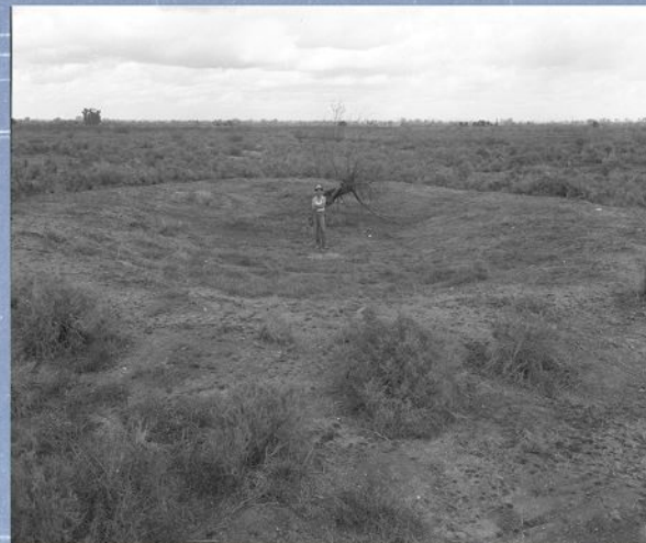
Photograph of a Hohokam ballcourt (A.D. 750 to 1075) at an archaeological site in South Phoenix. 1940. Image S7:2.