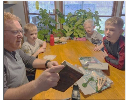
Take It Make It Greenlee County Library System