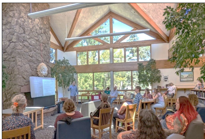
All-Staff Development Day Flagstaff City-Coconino County Public Library