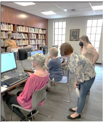
Tech Literacy Workshops Desert Foothills Library