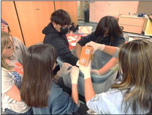
A to Z Teen Life Skills Page Public Library

See WiFi Hotspot Lending and Staff Development Day Express Grants below.