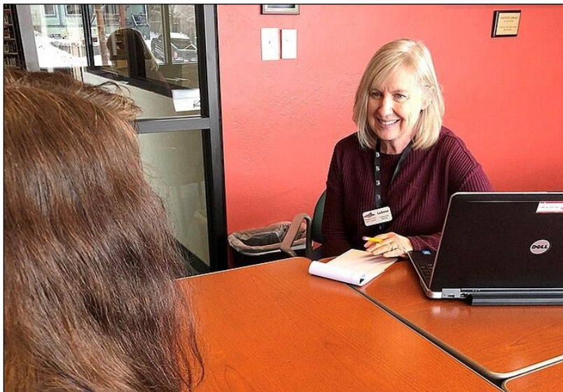
Here to Help Community Services Specialist Prescott Public Library