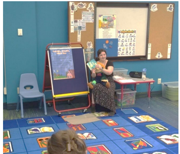
Storytime Collection Renovation Peoria Public Library

Federal regulations require that grant recipients take reasonable steps to ensure meaningful access to the information, programs, and services they provide to people with limited English proficiency. Please consider language assistance services, if appropriate, when designing your project.