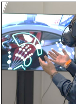
VR for Teens Mesa Public Library