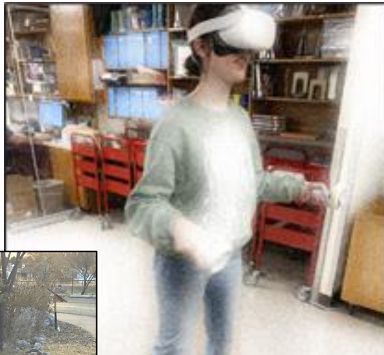
YA XR @ PCPL Pima County Public Library