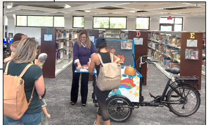
Pedal Express Peoria Public Library