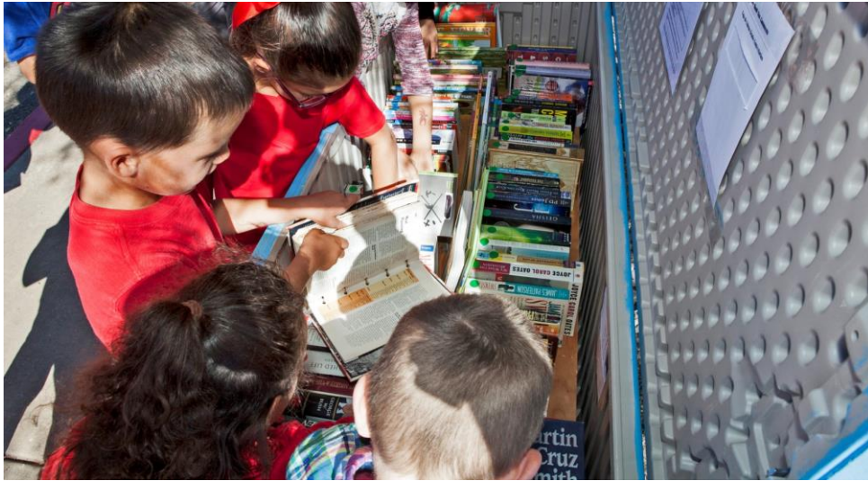
Free Book Box in Palominas / Cochise County Library District