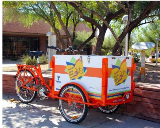
Book Bike Tempe Public Library

Examples of Inclusive Communities projects include job help programs; makerspaces; community conversation programs; community referral; and library "outposts"; and other programs targeting underserved communities or groups.