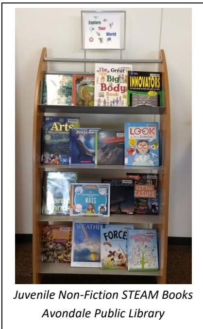
Juvenile Non-Fiction STEAM Books Avondale Public Library